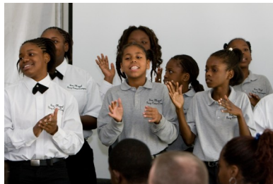
Students from San Miguel Middle School, a school in the Austin neighborhood, sing at a press conference for CTK last Fall.

I think definitely the neighborhood does need a fresh makeover and Christ the King