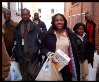
Committed to Justice: Students become "men and women for others" as they serve the community.