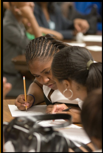
Intellectually Competent: Students work hard in a rigorous college-prep curriculum.