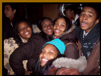
Loving: Students get to know their fellow "pioneers" at a brand new Ctk.