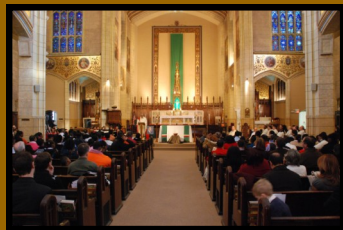
Religious: Students attended a number of masses in their first semester.

One of the salient characteristics of a Jesuit School is the "Grad at Grad" statement that sets forth goals and characteristics that a graduate of a Jesuit high school should attain by graduation. These are five characteristics shared amongst all Jesuit high schools: Religious, Intellectually Competent, Open to Growth, Loving and Committed to Justice . Christ the King has one additional trait — seasoned, responsible worker — to reflect the unique nature of the school.