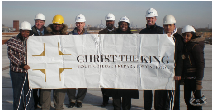
Students, faculty and staff celebrate the "Topping Off" of the new school.

Students have also had the opportunity to tour the site, check out the plans and sign some of the beams, forever marking their place in history as CtK's Founding Class of 2012.