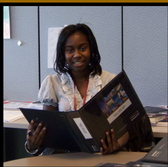
A Seasoned, Responsible Worker: Students are provided with feedback and training to constantly improve.