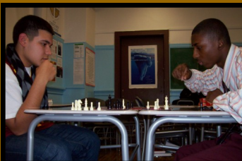
Open to Growth: Students participate in co-curricular activities.