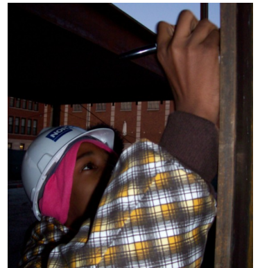
A student signs a beam in the structure.

school building is going to impact not only the kids who go to school there, but the neighborhood as well. The school is designed to be uniquely open, "... literally and figuratively a beacon on the west side," says Crowe.